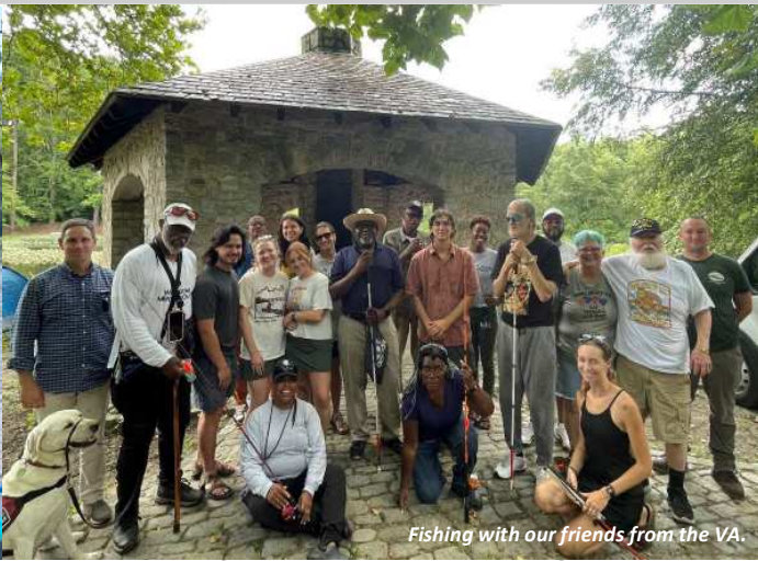
Fishing with our friends from the VA.