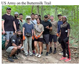
US Army on the Buttermilk Trail

Hours of Service 543 Events Completed 32 Total Volunteers 224 Average Hours per volunteer 2.4 Avg. Volunteers per event 7.0