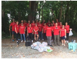
BDO Pony Pasture Cleanup